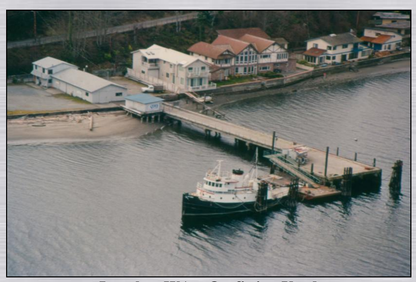
Langley, WA - Outfitting Yard