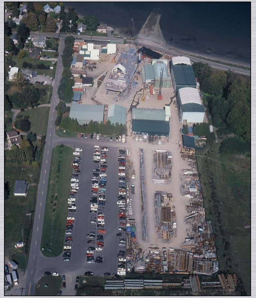
Freeland, WA - Main Boat Yard